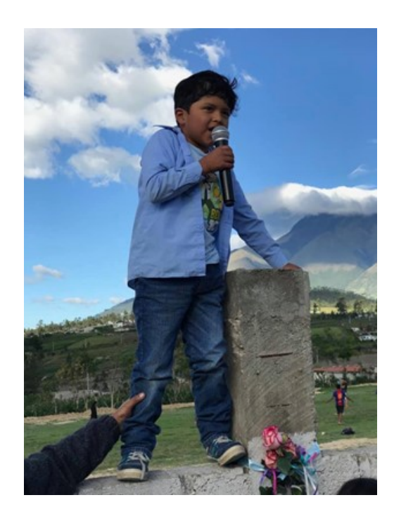
This is why we pack shoeboxes

We will be packing shoeboxes on Saturday, November 6, at 9:00 a.m. Your help is welcome. Put the date and time on your calendar and plan to participate.